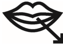
To Speak/ To Talk

Join in with our Sign of the Week. Make and share your own video using the hashtag #WeTalkMakaton.