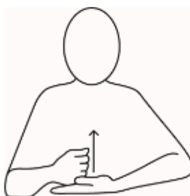
To Help (1)

We have provided you with these signs and/ or symbols free of charge. With your help The Makaton Charity can help more people communicate, please donate online at makaton.org/donate