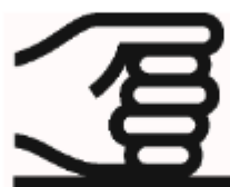
To Help (1)

Join in with our Sign of the Week. Make and share your own video using the hashtag #WeTalkMakaton.