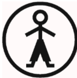
Daddy/ Father/ Dad

Join in with our Sign of the Week. Make and share your own video using the hashtag #WeTalkMakaton.